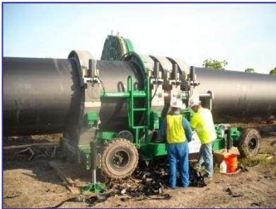
A fusing process is used to join two segments of the 64" HDPE pipe together.

This project includes the construction of a portion of the new force main from the PS58 to the South WWTP. The construction of the direct force main from PS58 to the South WWTP alleviates the wet weather flows into existing downstream gravity pipe, and allows the capacity needed for future flows in the Staring Lane area. This project is being constructed simultaneous with the Green Light Plan's (GLP) roadwork.