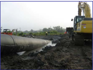
The entry pit for the 64" HDPE pipe is installed using the HDD method.