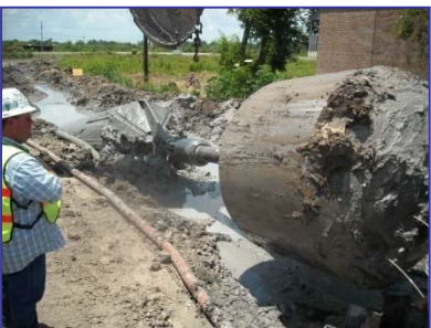
Completing the first of two Horizontal Directional Drills under Burbank Drive in the Staring Lane Phase 1 project area.